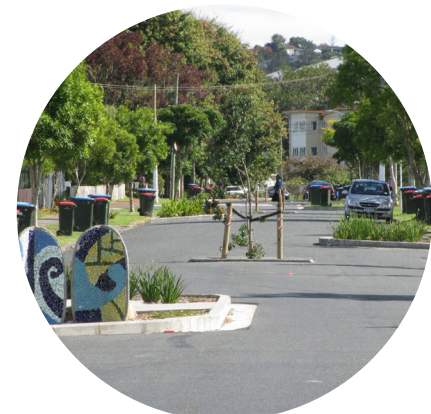
Traffic calming with planted buildouts