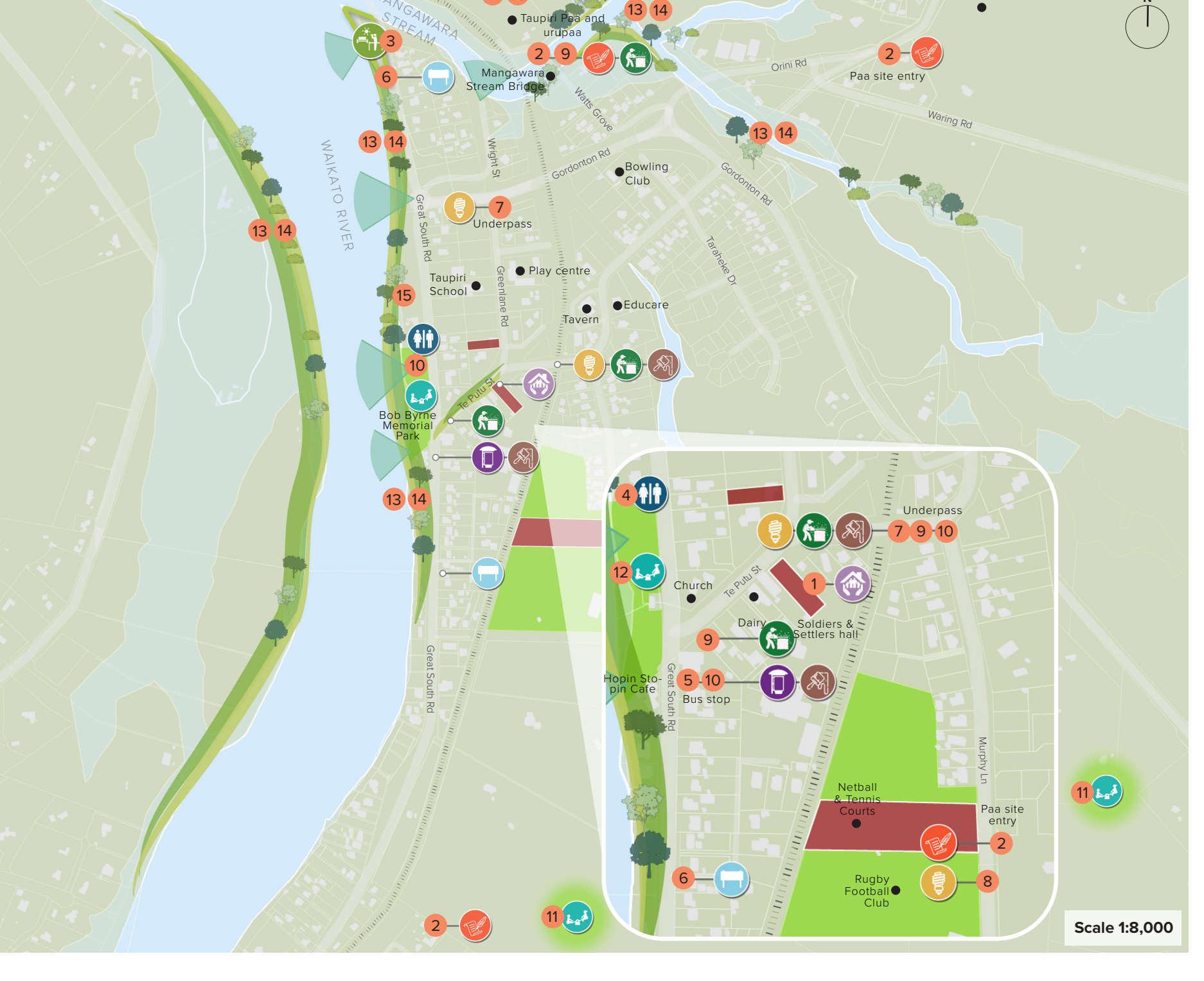
Separated cycleway on Great South Road