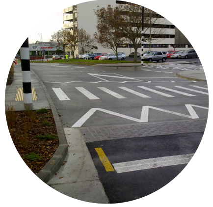
Raised pedestrian crossing