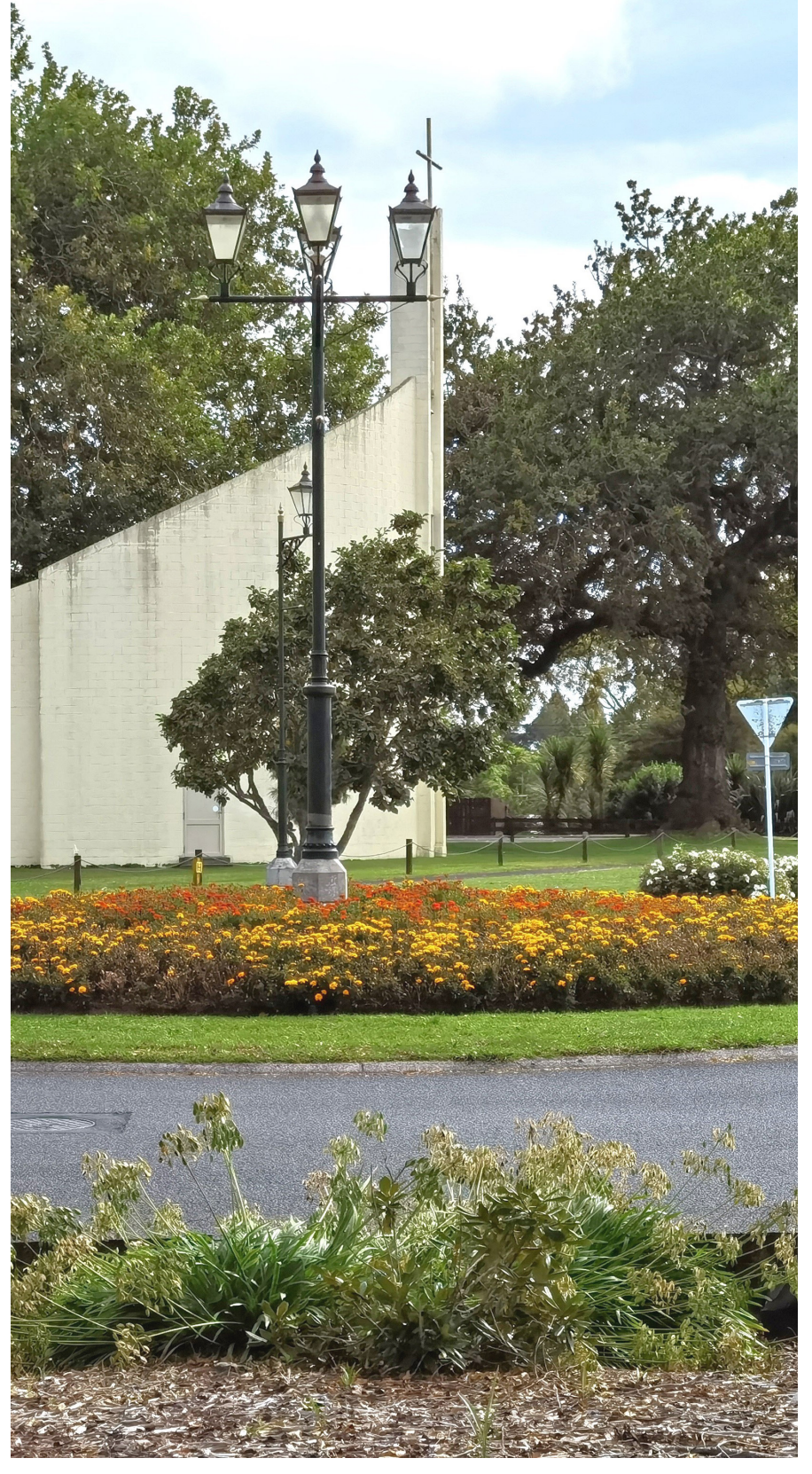
View of Holy Trinity Anglican Church in Ngaaruawaahia

Projects which relate to Climate Change Mitigation Actions include those that include improved resilience and will support reductions in Vehicle Kilometres Travelled (VKT).