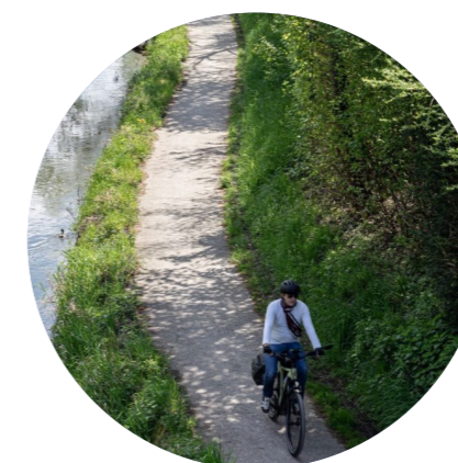
Riverside shared path