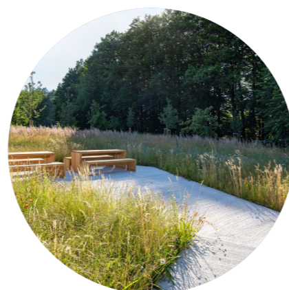
Rest stop and viewing area