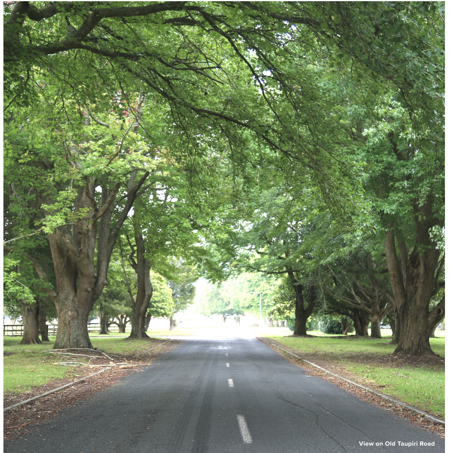
View on Old Taupiri Road

The following pages provide a summary of the opportunities identified through this process. Some of the opportunities sit outside of the remit of Waikato District Council, however were recorded to fully understand the issues and opportunities seen by the community. These opportunities have been assessed and considered by Council as part of this process and have informed the key moves and outcomes. Not all opportunities have been progressed.