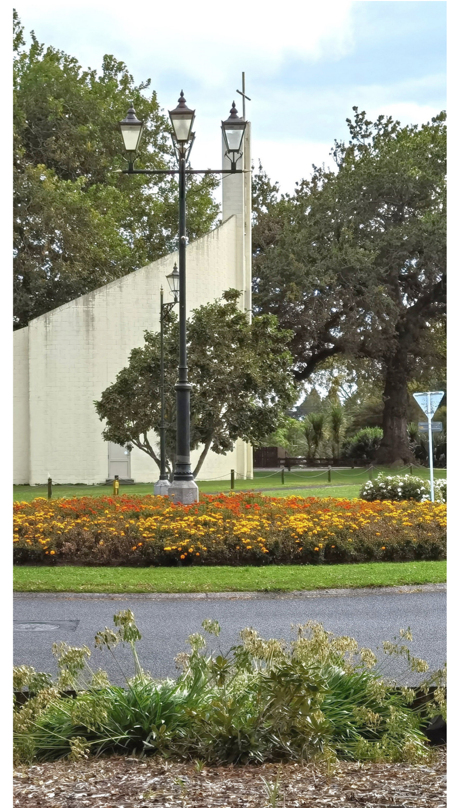
View of Holy Trinity Anglican Church in Ngaaruawaahia

The table provides a tool for future identification and prioritisation of investment across the three townships across the short, medium and long term.