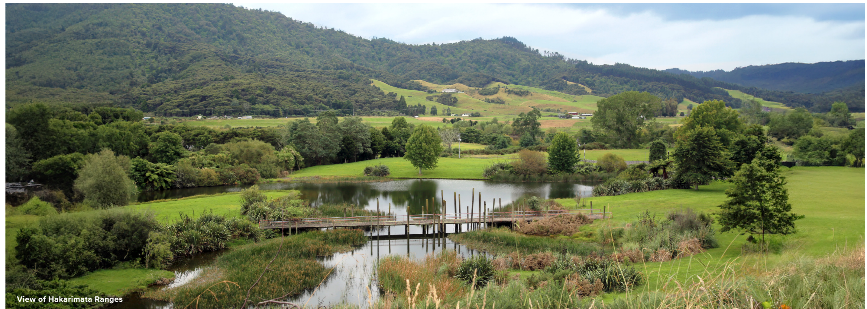
View of Hakarimata Ranges