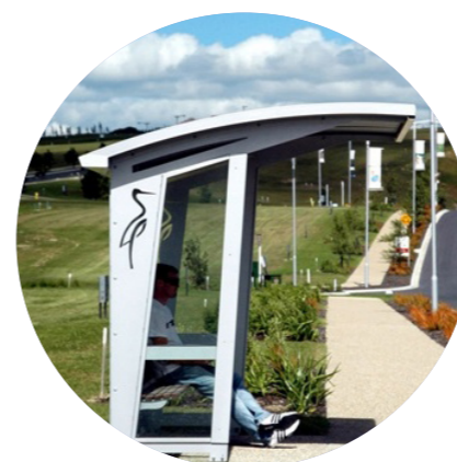
Upgraded bus shelters