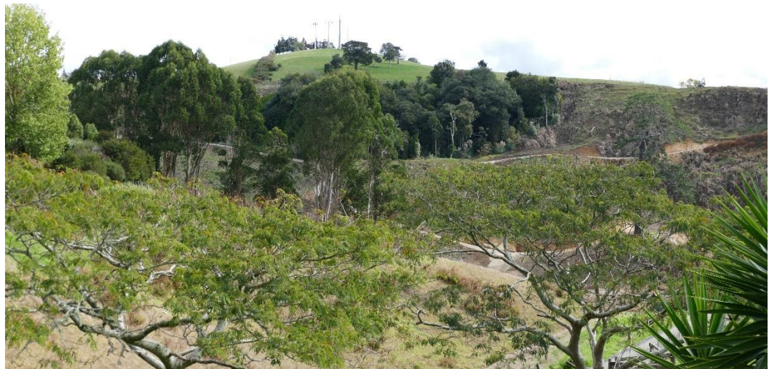
Photograph 1 the view looking west from 62 Bluff Road to the Buffer Area 1 land.

3.5 Photograph 1 below illustrates a view looking toward 'Transmission Hill' from the east (on the property at 62 Bluff Road). A shelterbelt which follows the cadastral boundary can be seen to the left of the knoll / cell towers rising up the landform. This cadastral boundary is the proposed western boundary for Buffer Area 1.