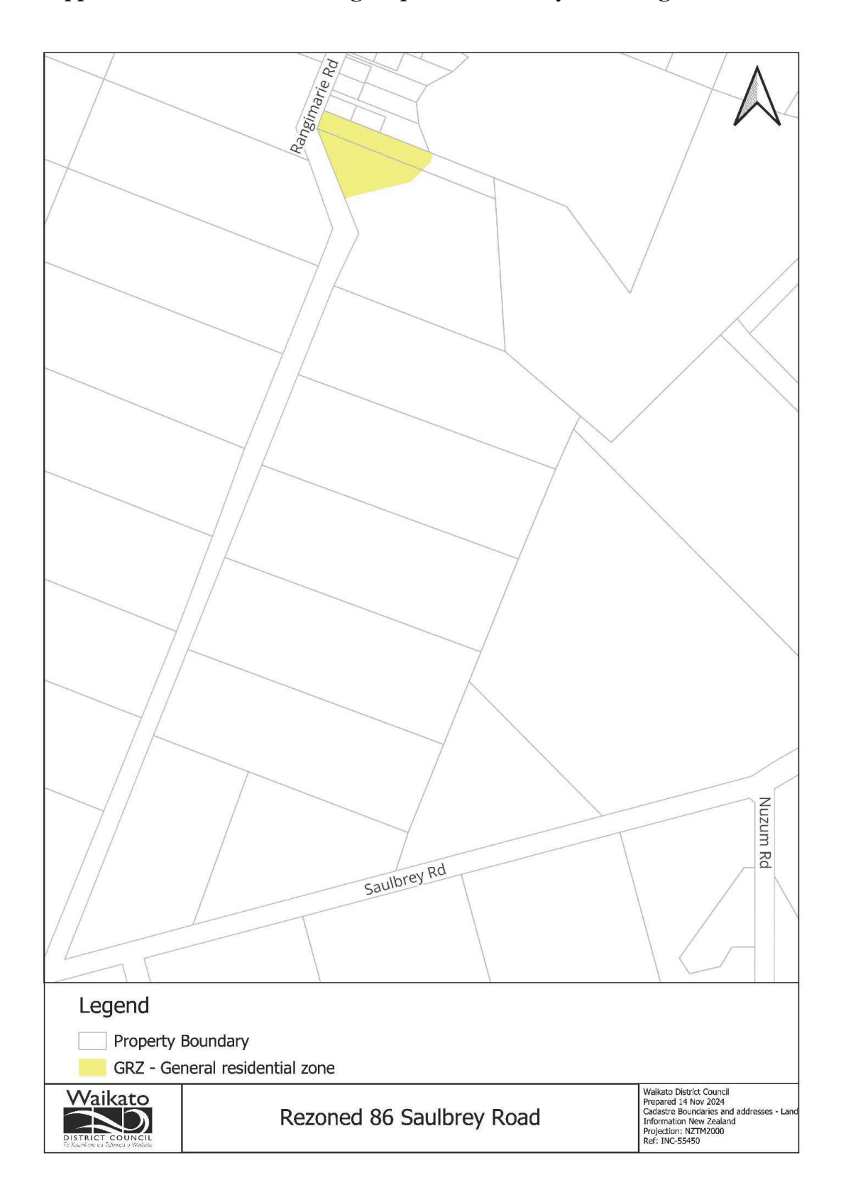
Appendix A – Amended zoning map for 86 Saulbrey Road, Ngaaruawaahia