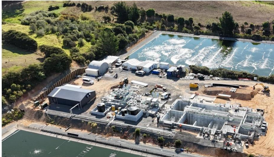
Raglan Wastewater Treatment Plant

Once this is complete, the clear water commissioning will commence (April 2025) in preparation for being turned into service.