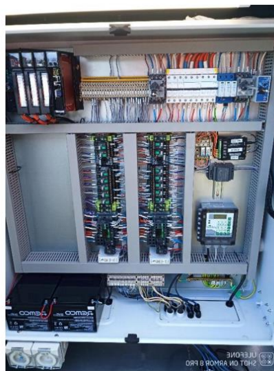
Raglan Campground – New pump control cabinet with kingfisher PLC and digital radio

Whilst resolved, this has resulted in a delay, and completion is now scheduled for October 2025.