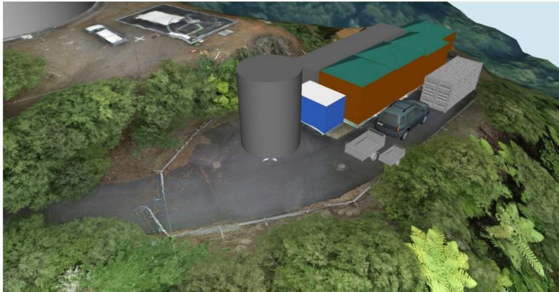
Ngaaruawaahia Water Treatment Plan Upgrade- New Clearwater backwash tank (grey) and Chlorine room (Blue)