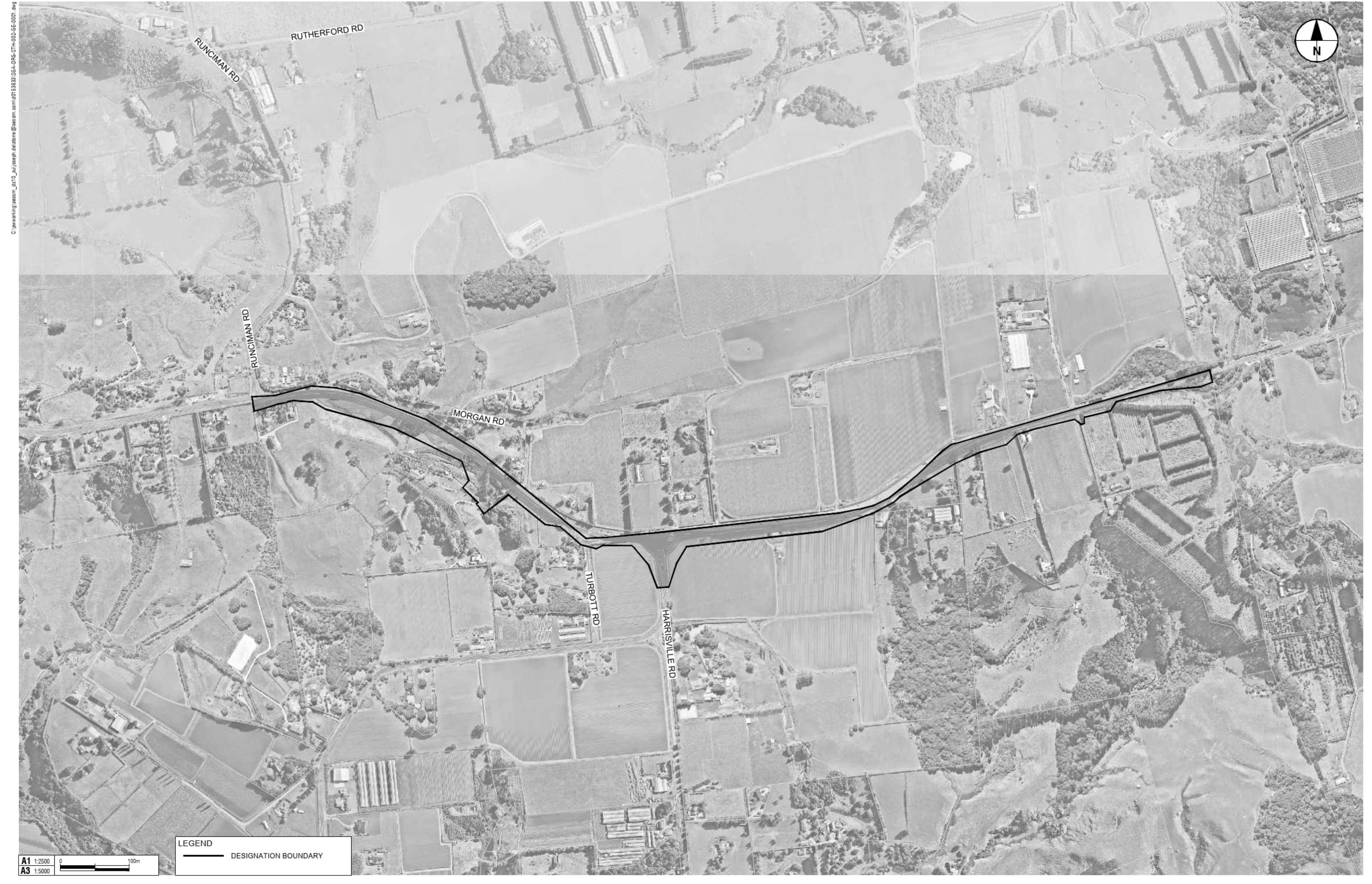
NoR 8 (WDC) - MILL ROAD AND PUKEKOHE EAST UPGRADE