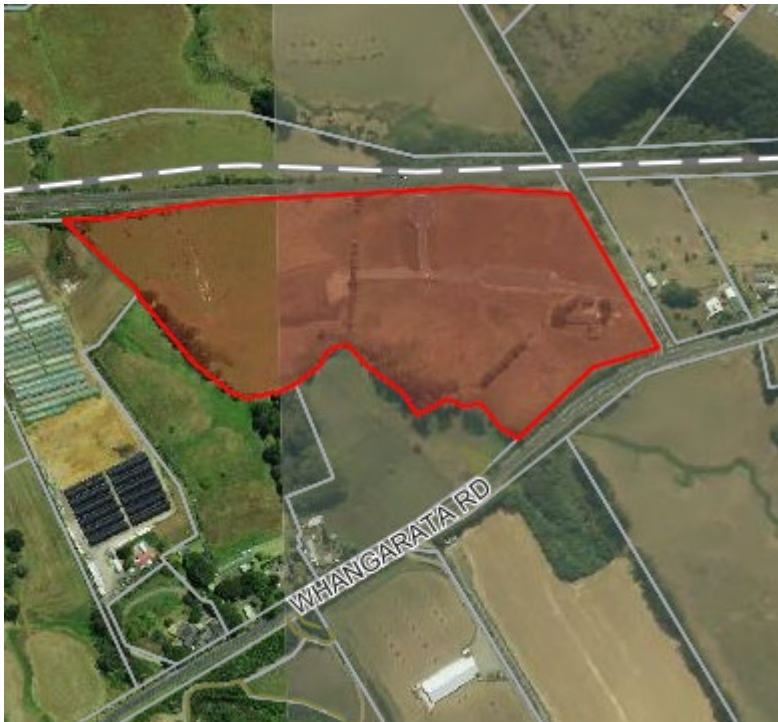
Image 1: 327B Whangarata Road property, intended for cemetery purposes, identified in red.

327B Whangarata Road (Lot 1 DP 101962 and contained within Certificate of Title NA 57B/631), colloquially known as the Whangarata Dog Park is approximately 8.306 ha in area (Image 1 and Attachment 1 – Location Plan)