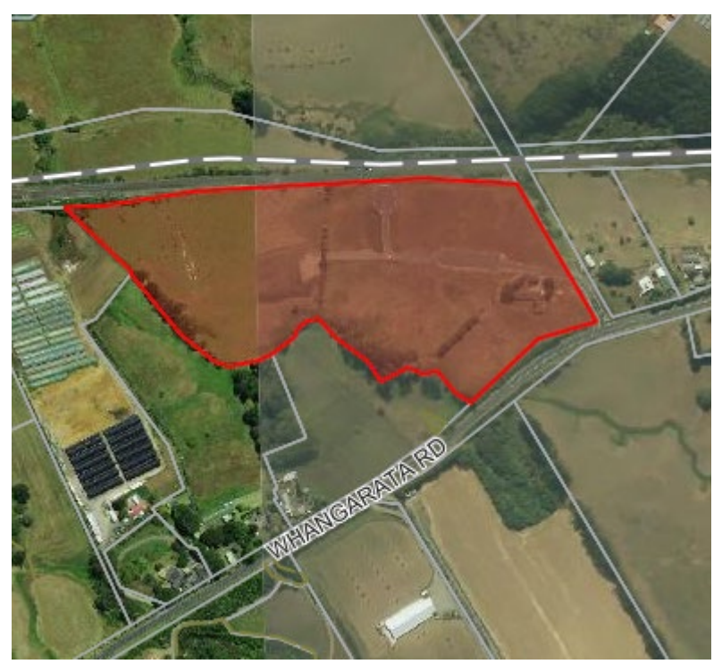
Image 1: 327B Whangarata Road property, intended for cemetery purposes, identified in red.

327B Whangarata Road (Lot 1 DP 101962 and contained within Certificate of Title NA 57B/631), colloquially known as the Whangarata Dog Park is approximately 8.306 ha in area (Image 1 and Attachment 1 – Location Plan)