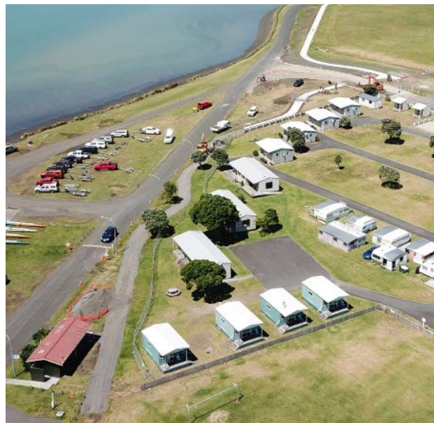
Papahua Path progressing

The concrete path east of the campground entranceway is starting in sections. Community Connections are continuing conversations with the Football Club. Campground are to provide scope of fence requirements. Targeting completion of path and entranceway on 3 December.