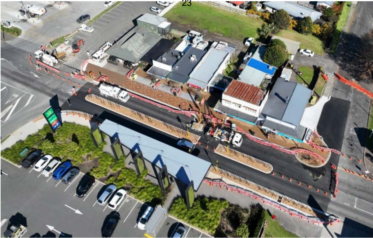
Main Street looking west