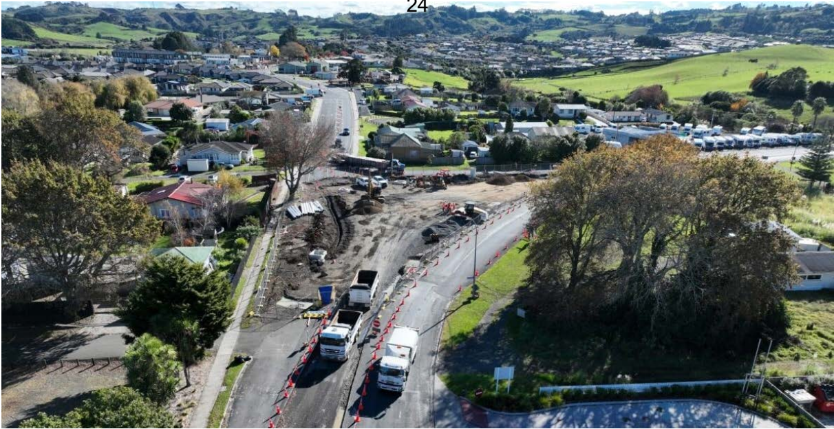
Roundabout site looking north