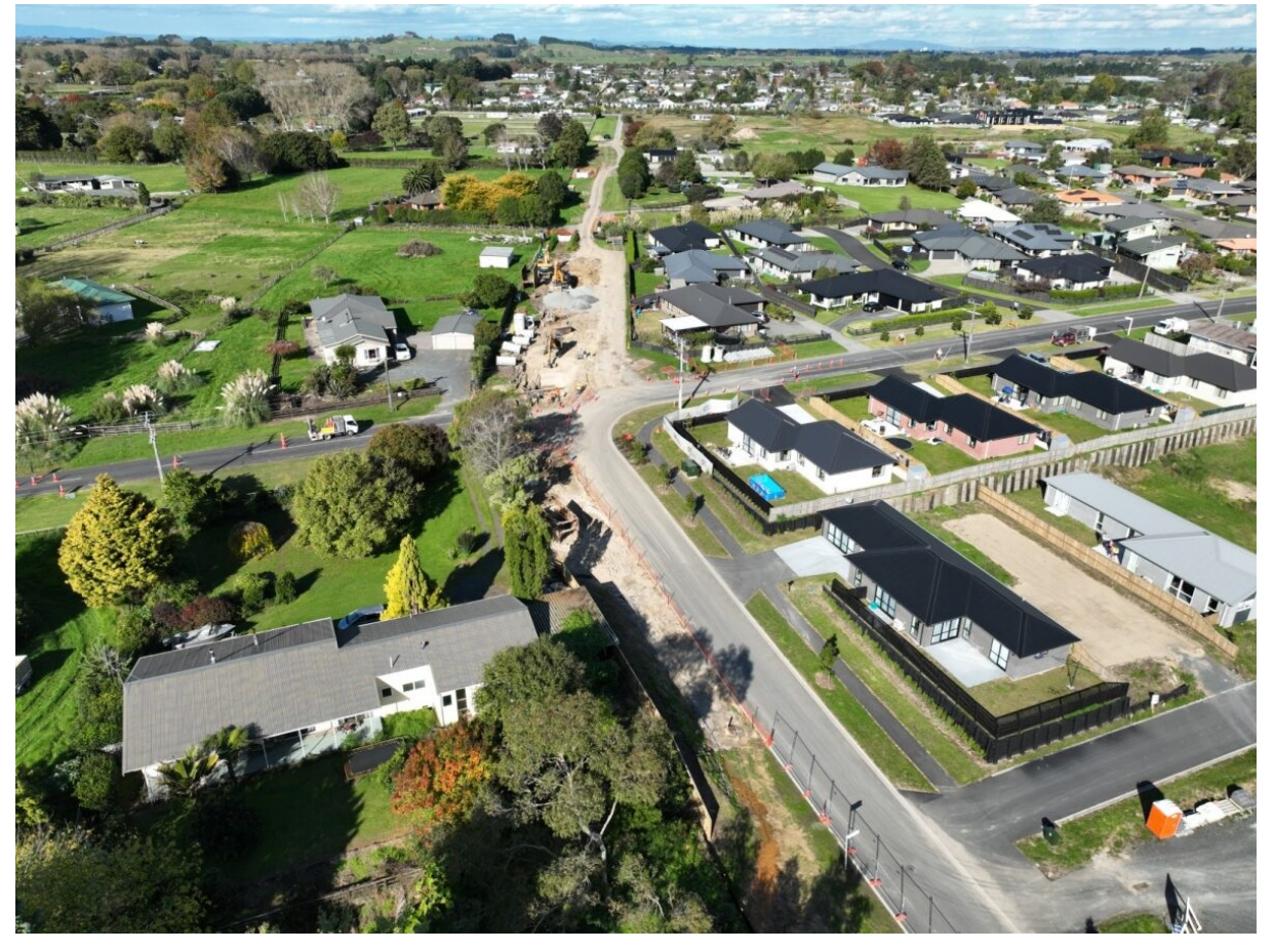
Festival Way construction

Project is due to be completed by the end of the 2024 construction season.