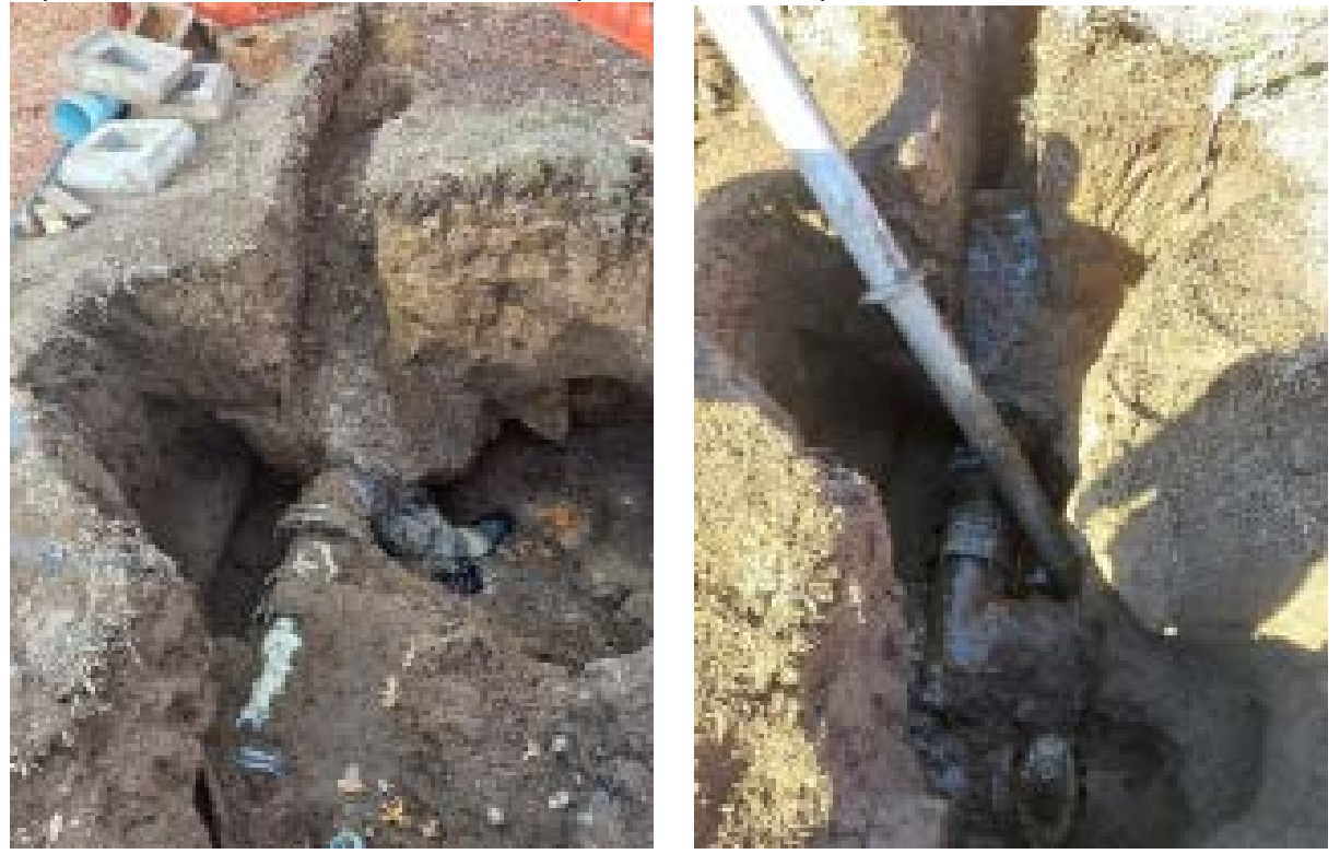
Leak repair works

Redundancy in the network allowed the area to be backfed without disrupting the customer's supply. Fortunately, the fault was outside of the KiwiRail corridor, so that the repair could be conducted without a special access request.